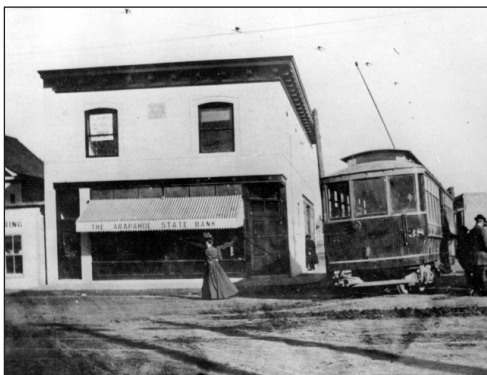
Surplus store skinny parking lot where it turned around.