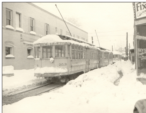
Going through the skinny parking lot by the Surplus Store