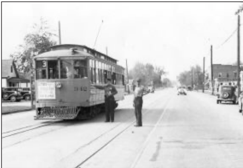
Gothic Theatre in the distance

60 years. The line was discontinued in 1950 and buses took their place.