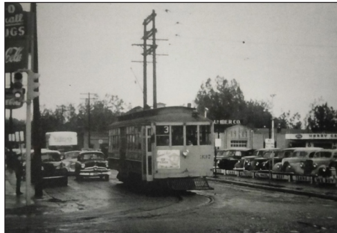
Corner of Hampden and Broadway turning north