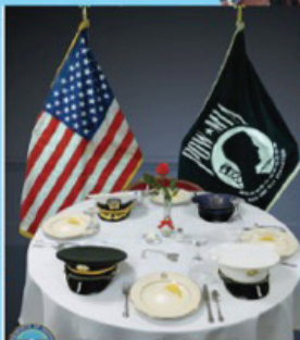
Rolling Thunder Missing Man Ceremony