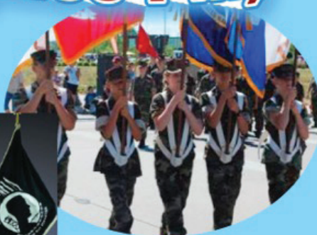
D.C. Young Marines

MAY 28TH, 2017 AT 2:00 PM | COME EARLY TO GET A GOOD SEAT! Fisher Auditorium - ENGLEWOOD HIGH SCHOOL - 3800 S. Logan St. Englewood, CO 80110